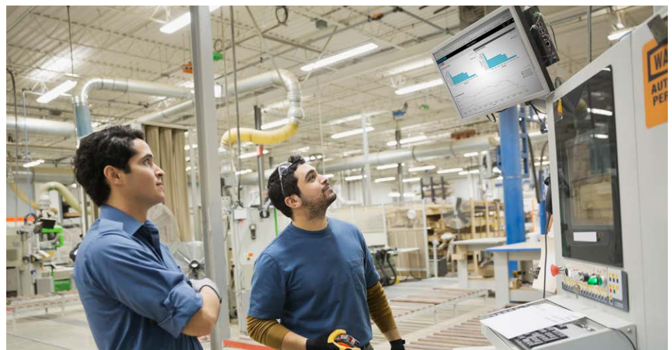
Public Internal Dashboards give your employees the information they need when they need it.

EDA answers these questions about your finance data: