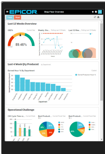
Mobile dashboards let you take your data with you.